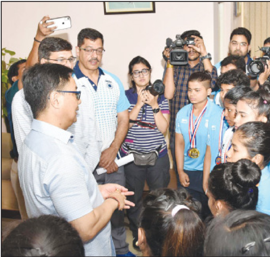
The Minister of State for Youth Affairs & Sports (Independent Charge) and Minority Affairs, Shri Kiren Rijiju interacting with the athletes of the Indian Contingent who participated in the Commonwealth Weightlifting Championship in Samoa and Won Several Medals, in New Delhi.

"The move was just to target teachers and nothing else. If the government wanted to work, couldn't they improve other areas of infrastructure?"