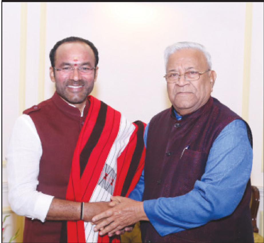
The Governor of Nagaland, Shri Padmanabha Acharya meeting the Minister of State for Home Affairs, Shri G. Kishan Reddy, in New Delhi.